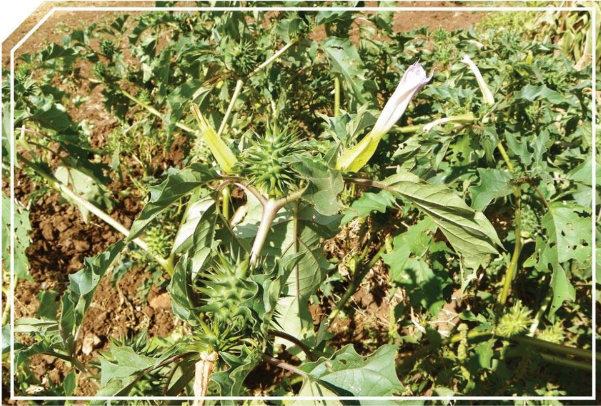
The Datura plant is commonly known as "Olieboom".

Datura, commonly known as 'Thorn apple' or 'Olieboom', is a very common weed in most crop producing regions of South Africa. It drives us all mad and they never seem to stop emerging. This weed can be an absolute curse to control and can have severe negative impacts on your crop if left unmanaged.